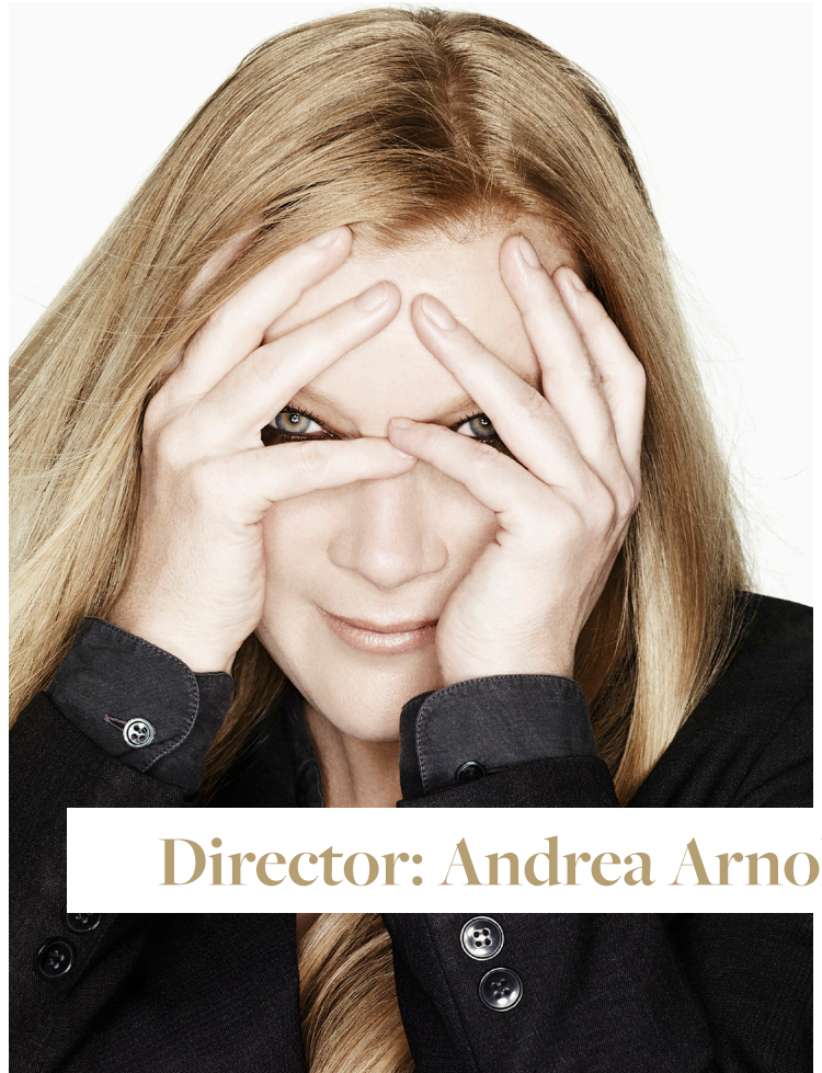
Director: Andrea Arnold